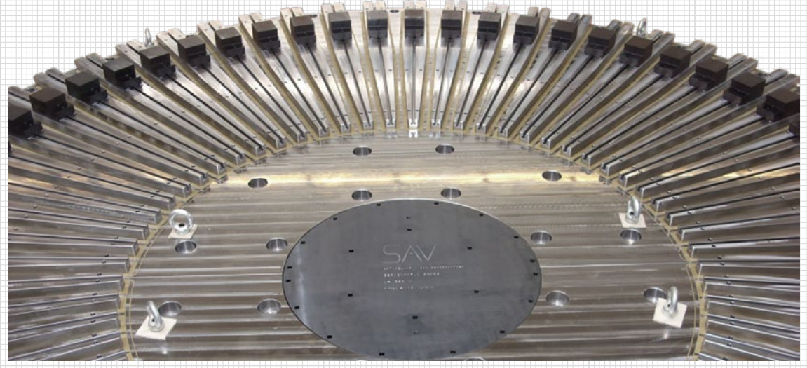
Larger diameters, e.g. 5.5 m, available on request. Allocation to the correct control unit is based on the max. power consumption, SAV 876.17.